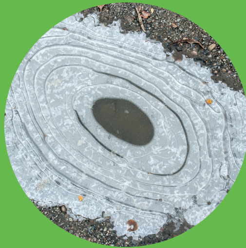
A frozen puddle