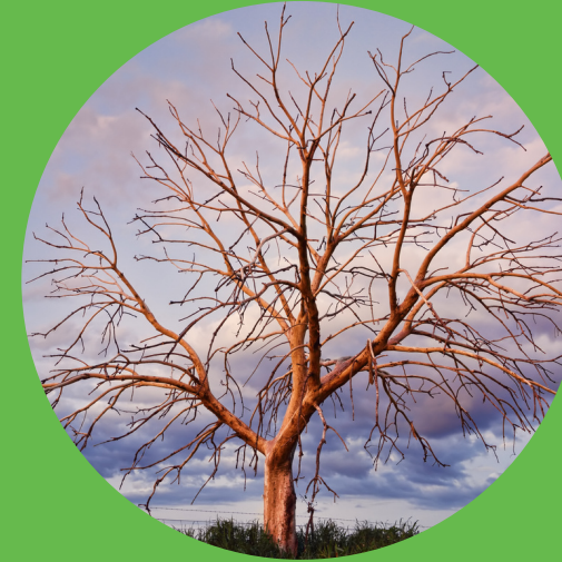
Trees with no leaves