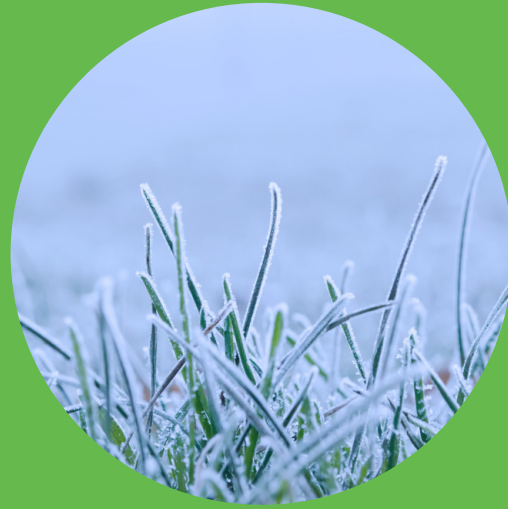
Frost on the grass