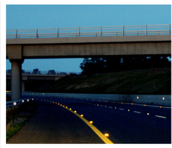
Cat's eyes are light reflectors