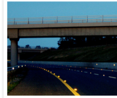
Cat's eyes are light reflectors